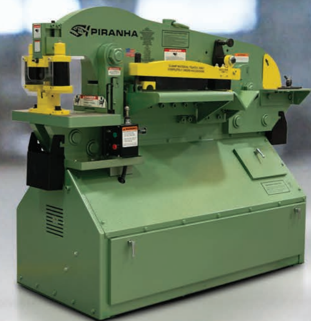
P-90 P-110 P-140