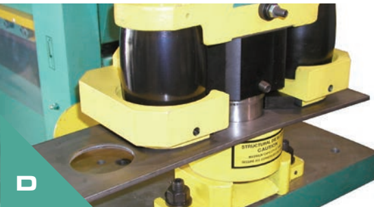
D 28XX PUNCH ATTACHMENT