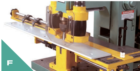
F QUICKSET GAUGING TABLES