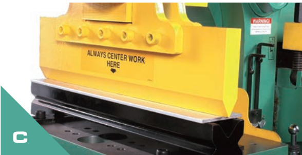
C BENDING ATTACHMENT