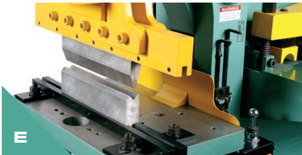
E PRESS BRAKE TOOLING HOLDERS