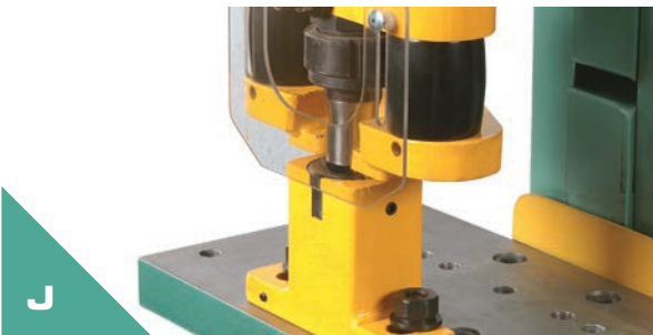
J 1-1/2" OVERSIZE PUNCH ATTACHMENT