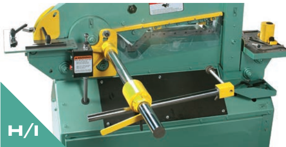
H/I MECHANICAL/ELECTRICAL BACK GAUGES