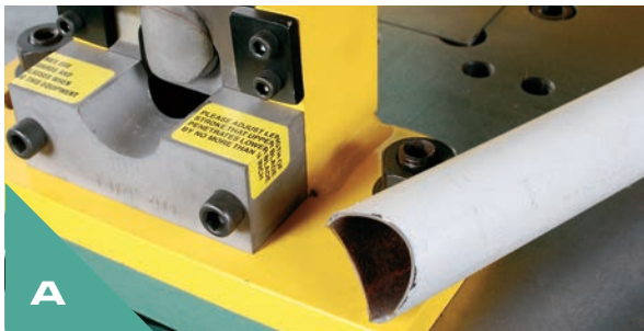
A PIPE/TUBE NOTCHING ATTACHMENT