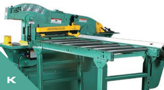
K ROLLER FEED TABLES