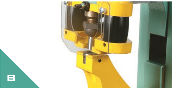
B CHANNEL DIE BLOCK