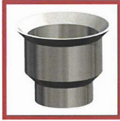
Expand & Flare