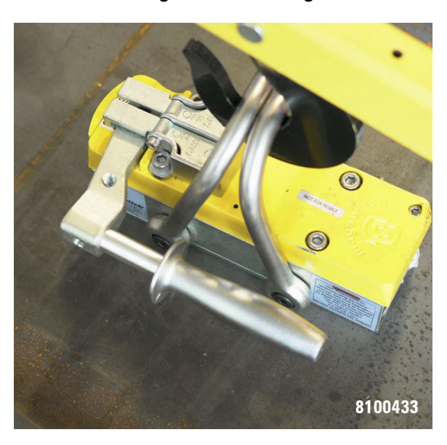
Lifting Manhole Cover with MagDolly