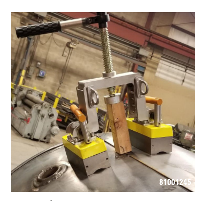
Grinding with MagVise 1000