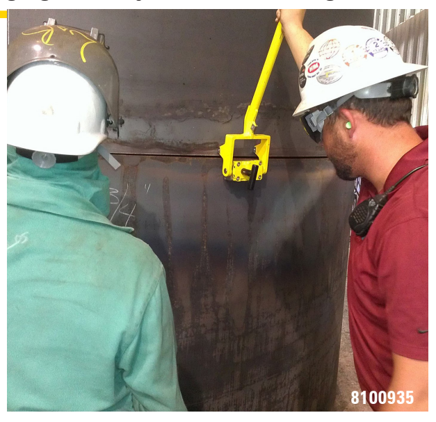
Sheet Alignment with MagPress

turn the magnet on and pull the lever up to align.